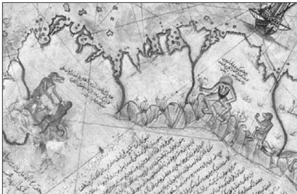
Figure 1. Two monkeys of the New World in the Piri Re'is' Carte de L'Atlantique 1513. One is to the right of a cynocephalus (on the left of the map) and the other to the right of an acephalus (on the right of the map) (La Ronciere et al. , 1984: plate 28).

Mediterranean Sea around 1501. In fact, Piri Re'is' map may reflect the earlier Columbus map of 1498 (La Ronciere et al. , 1984: 218), which coincidentally is the year that Columbus, in his travels, first reported on monkeys in America (Urbani, 1999). In the highly detailed map of Piri Re'is, baboon-like monkeys in the New World were drawn for the first time (Fig. 1). It is possible to infer that these illustrations were made with African primate referents, as were the reports by other travelers in the New World such as Amerigo Vespucci (who referred to Neotropical primates as baboons and macaques; Urbani, 1999) and Arabic chroniclers (Kruk, 1995). On the other hand, Piri Re'is might have obtained another original source on New World monkeys directly from the Europeans. Two primates are represented and associated with mythical animals, one "dancing" with a cynocephalus (dog-head) and another with a fruit in its hand together with an acephalus (headless) (Fig. 1). These monkeys were illustrated as inhabiting the area that is currently Colombia, Brazil, and Venezuela.